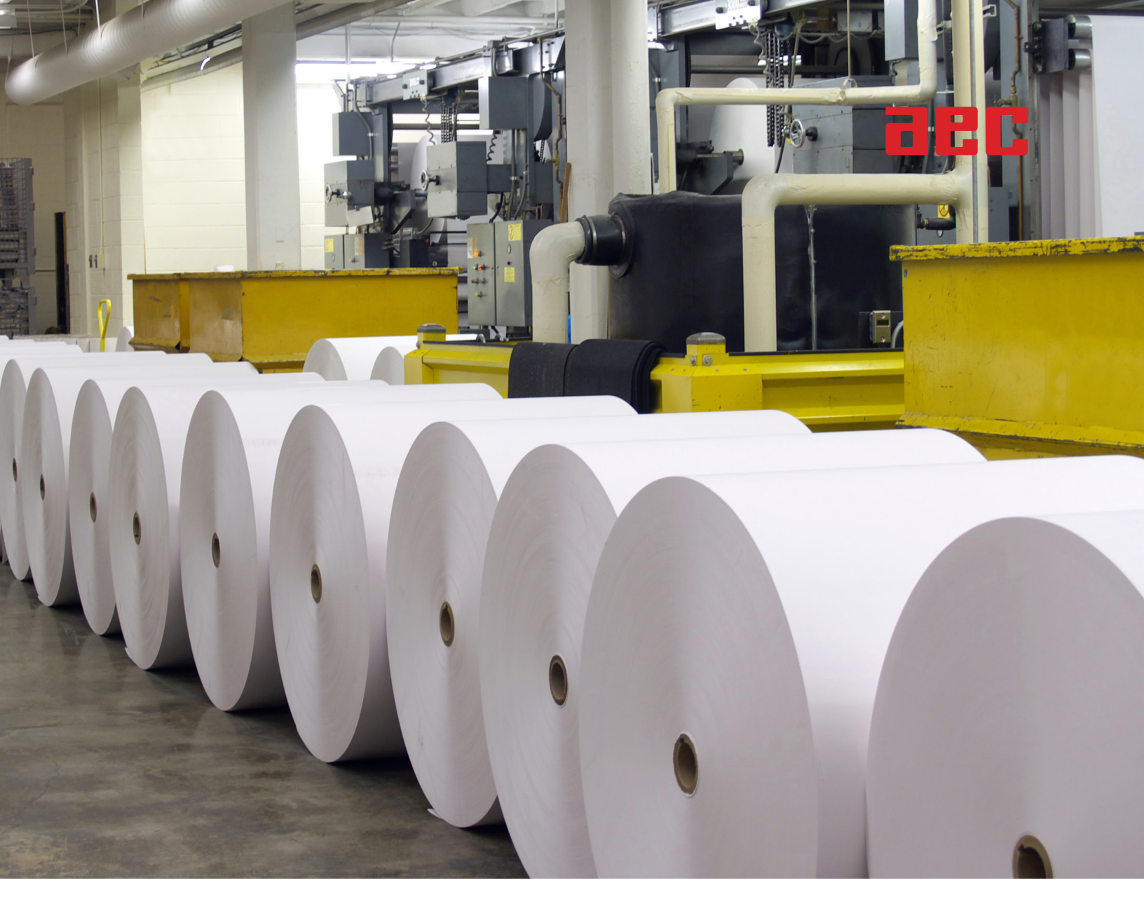
Think Motion | Think AEC